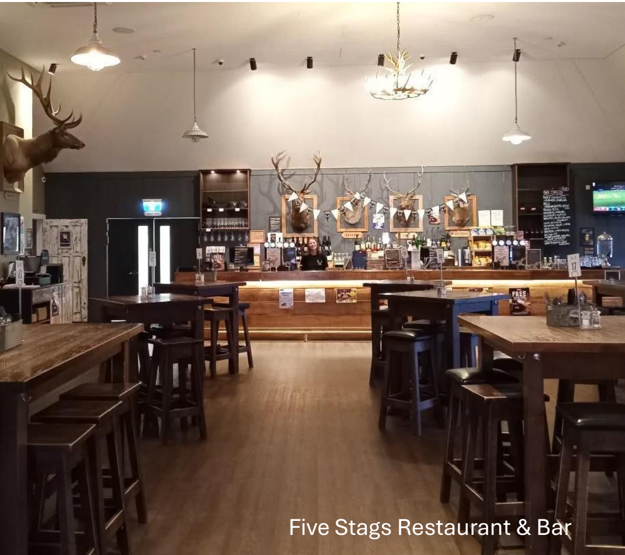
Five Stags Restaurant & Bar

Tour groups overnighiting enjoy breakfast in the newly renovated Gentle Annie's dining room with 2 or 3 course set menus available for group lunches and/or evening dining in Five Stags Restaurant & Bar. Alfresco areas plus Forage Café offer guests multiple on-site dining options and spaces at this 47 room 3.5 star hotel. Free coach parking and an easy 45-minute drive to Queenstown Airport.